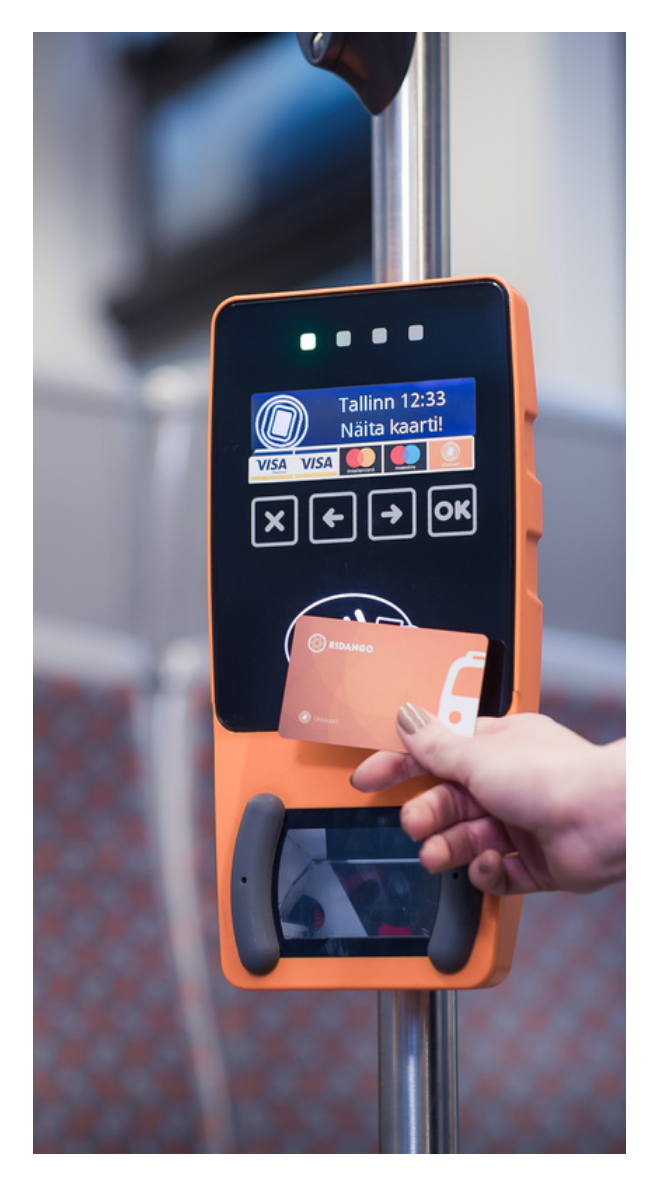
Smart Ticketing Systems.

In addition, open loop ticketing systems also provide real-time information on fare balance and special promotions, further improving the passenger experience. This information can be accessed through the passenger's mobile device, eliminating the need for manual calculations or tickets to be physically checked.