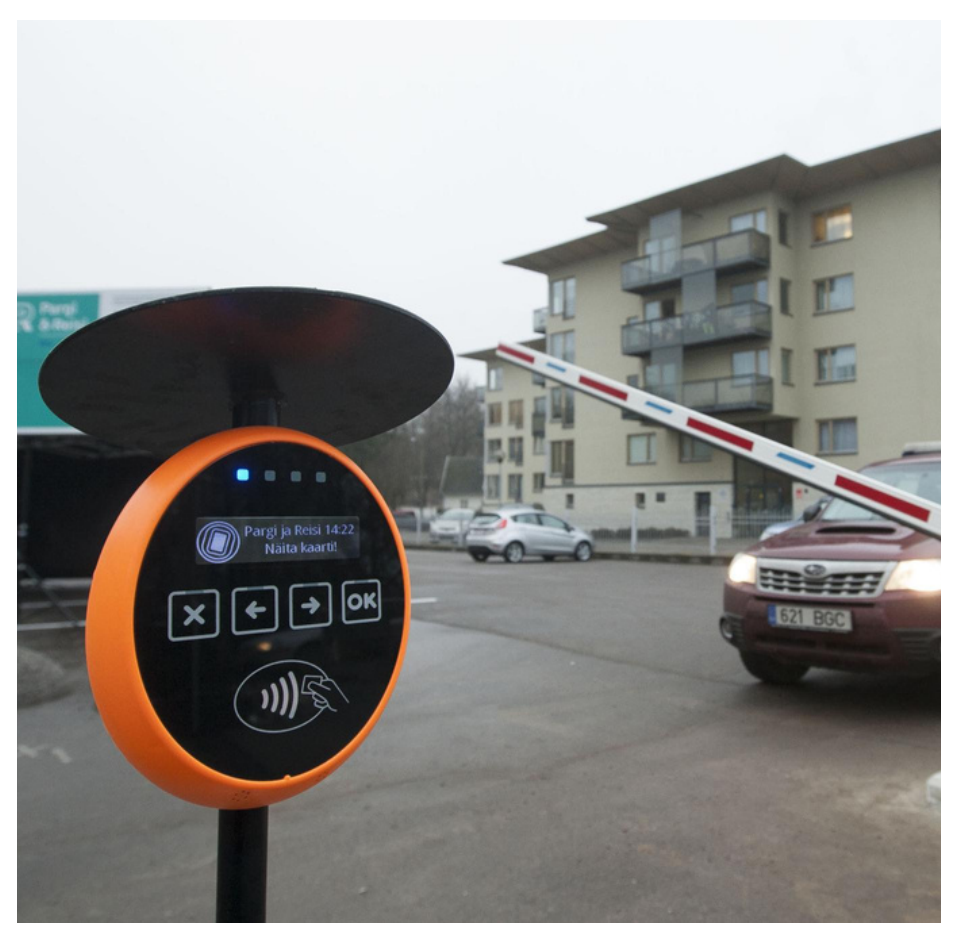
Park & Ride facilities.

In addition to improving public transport systems, communities can also encourage the use of services by promoting sustainable transportation. This can be done through public campaigns, promotions, and incentives. For example, offering discounted or free tickets to people who reduce car use can encourage more people to use public transport. Additionally, creating car-free zones in city centers, or offering incentives for cycling or walking instead of driving, can help promote sustainable transportation and reduce emissions.